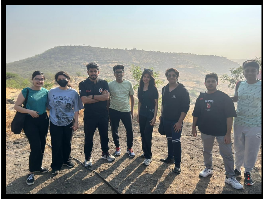
4. PHOTOGRAPHY DEPICTING GREEN COVER ACHIEVED BY ECO WARRIORS.